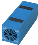
RM PPS module with Multidiameter™